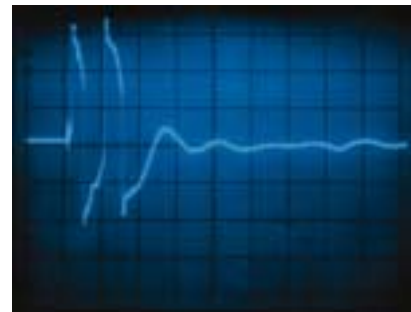
TYPICAL SURGE SUPPRESSOR-BASED UPS OUTPUT

ONEAC, FOUNDED IN 1979, HAS AN ENVIABLE REPUTATION IN THE INDUSTRY AS AN INNOVATOR, A TECHNOLOGY LEADER AND AN EDUCATOR. TODAY, ONEAC POWER CONDITIONING AND UNINTERRUPTIBLE POWER SUPPLY SYSTEMS ARE WIDELY USED IN SOPHISTICATED SEMICONDUCTOR FABRICATION PLANTS, CUSTOMER PREMISE TELECOMMUNICATIONS SYSTEMS, MEDICAL DIAGNOSTIC AND PATIENT TREATMENT SYSTEMS, AS WELL AS POINT-OF-SALE AND WIDE AREA RETAIL INFORMATION NETWORKS.